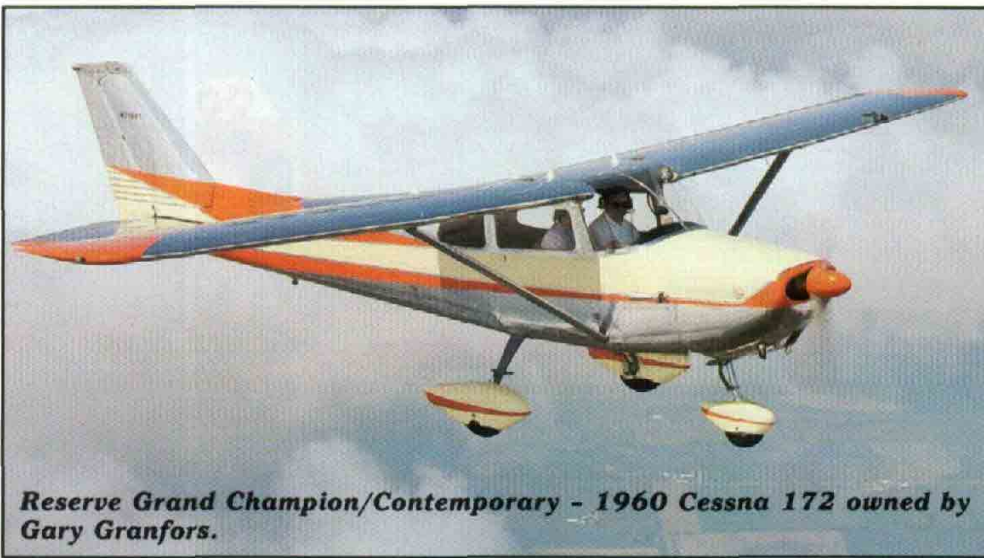
Reserve Grand Champion/Contemporary - 1960 Cessna 172 owned by Gary Granfors.