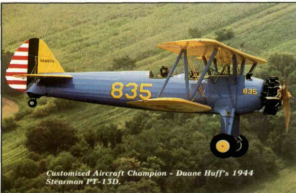
Customized Aircraft Champion - Duane Huff's 1944 Stearman PT-13D.